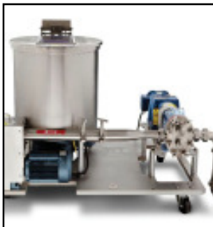
PTH35 Gallon (132 Liter) Cream Hopper, Available with 1 or 2 pumps