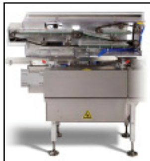
QS2 Row Combiner