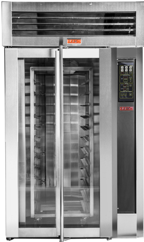
LMO Max-G (Rack not included) Note: Oven must be installed under a hood