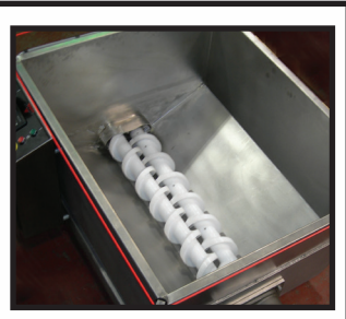
Twin Screw Auger Design