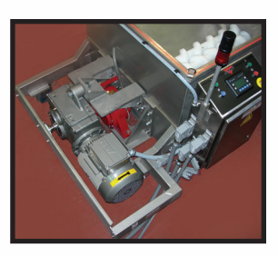
Direct Shaft Drive