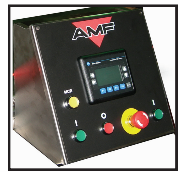
Optional Pump Mounted Station