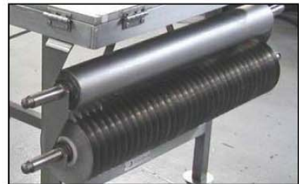
Table Cutter rolls along side slab bars and cuts entire length of batch

Rolling Drum Sizer weighted to roll batch flat